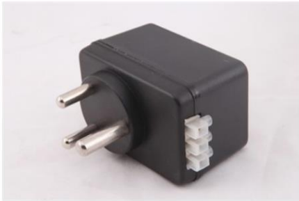
TRANSFORMER PLUG IN BOXED