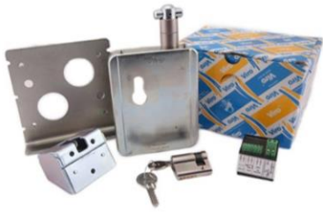
ELECTRIC LOCK FOR SLIDING GATE