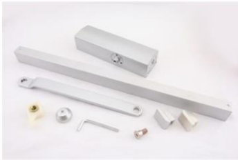
DOOR CLOSER 85KG-120KG SLIDE CHANNEL (ARM8)