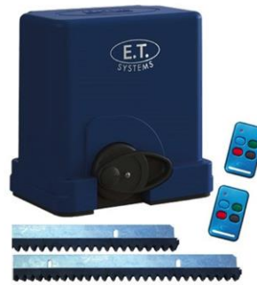
GATE MOTOR ET DRIVE 300