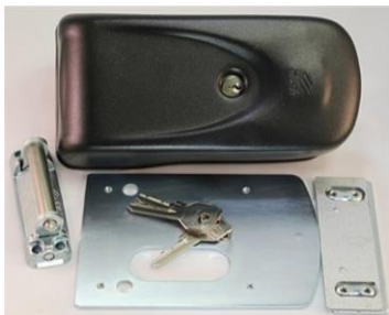
ELETRIKA ELECTRIC LOCK W/O BUTTON CISA