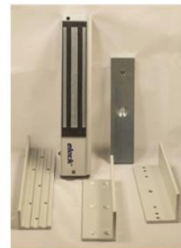
MAGLOCK 150KG SECURI PROD NO STATUS MAGLOCK 300KG WITH LED STATUS LIGHT MAGLOCK 600KG WITH LED STATUS LIGHT