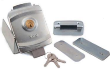
ELECTRIC LOCK OUTWARD OPENING VIRO