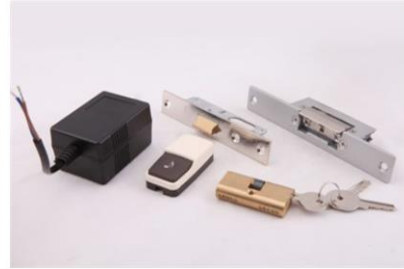
ELECTRIC LOCK KIT 15MM INYATI BLIS (BW)