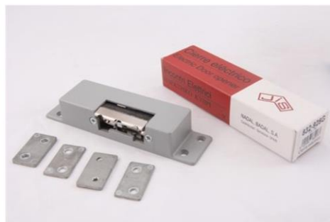
ELECTRIC STRIKE RIM 1030-925