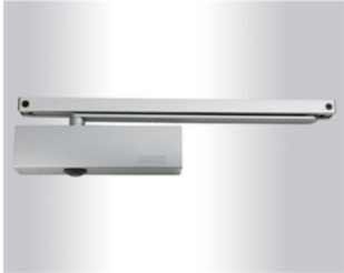
DOOR CLOSER GEZE TS2000 WITH GUIDE RAIL