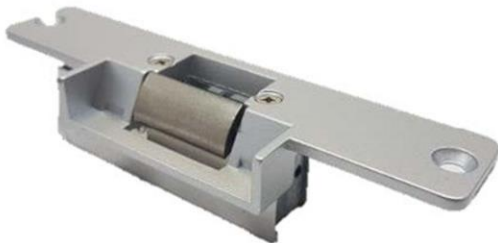
ELECTRIC STRIKE FOR ADAMS RIGHT