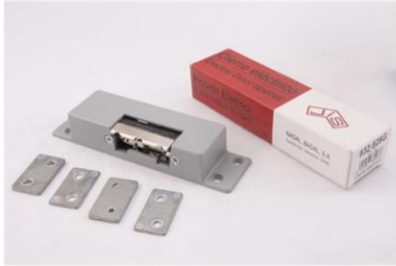
ELECTRIC STRIKE RIM 1030-925