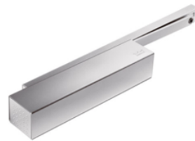
DOOR CLOSER TS91 DORMA C/W ARM DOOR CLOSER TS92 DORMA