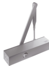
DOOR CLOSER DORMA TS73 DOOR CLOSER DORMA TS83