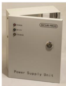
POWER SUPPLY 13.6VDC (3.2AM)