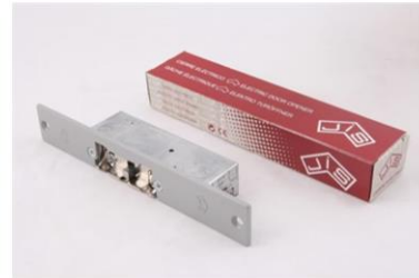
ELECTRIC STRIKE SINGLE PULSE 1030