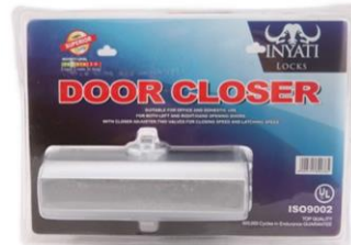
DOOR CLOSER BLISTER INYATI (BW) (DT63-2)