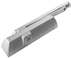
DOOR CLOSER TS90 DORMA SLIDE