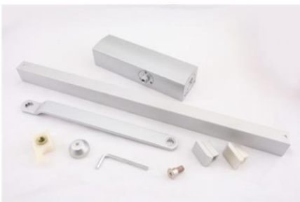
DOOR CLOSER WITH SLIDE CHANNEL 65KG