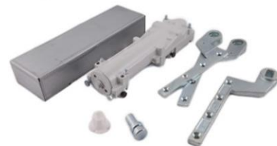
FLOOR SPRING D/A HOLD OPEN DORMA FLOOR SPRING DORMA NHN TIMBER DOOR