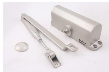
DOOR CLOSER EN3 STD SILVER DORMA BOX