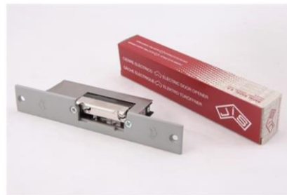
ELECTRIC STRIKE CONTINUOUS 1010